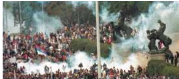
5th October 2000. The Bulldozer Revolution in Belgrade, Serbia the downfall of Slobodan Milošević's regime