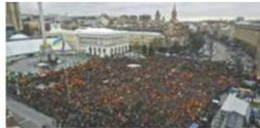
22th November, 2004. The Orange Revolution in Kiev, Ukraine thousands demonstrating for free elections

Achievements of liberalism in our region are by far greater after 1989 than before, due to the historical reasons. Nevertheless, in many of our countries before World War II and in the XIX century it was a driving force, mostly through the influence of liberal-oriented intellectuals implementing ideas of the Enlightenment and the French Revolution – the rights of individual, critical thinking, democracy and modernization. In the XIX century liberalism was often linked to the idea of national independence, not only personal freedom.