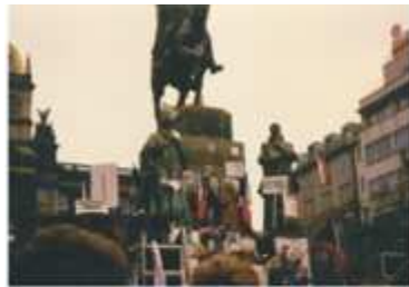
November 1989. Velvet Revolution in Prague, Czechoslovakia the overthrow of the Communist government